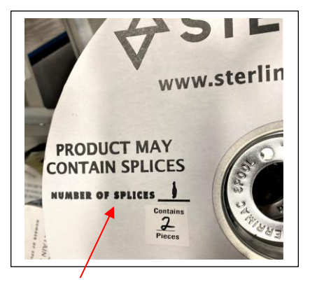
Splices should be indicated on the spool flange.